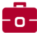
Corporate & Legal Compliance